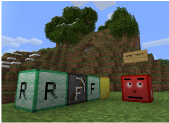
Figure 4. The commercial game Minecraft was extended by us with a robot programming language CodeBlocks [7], based on the metaphor of children's block play. The CodeBlocks project seeks to increase interest in computer programming using play as the motivation. As well, players can create puzzles and challenges for other students.

game to explore some educational topic, constructivist play, where they create and build, requires students to reflect and deepen and broaden their understanding in the explain and elaborate phases.