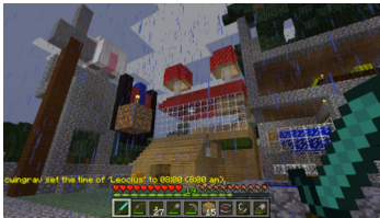
Figure 1. Minecraft is an open world game for creative play as demonstrated by the creations of our players. Minds of Chimera, our modified Minecraft server, allows gamers to modify and create quests for instruction and constructivist learning. We have been adding kinematics, Boolean logic and computer programming end-user tools as well as researching how to inspire creation and learning.