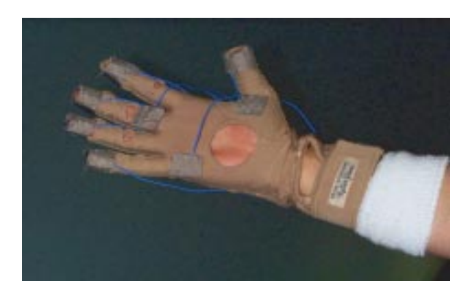
Figure 1: The Flex and Pinch input system. Although a CyberGlove[4] is shown, any bend-sensing glove can be used.

Pinch Glove since it uses eight cloth buttons instead of five which allows for more button combinations. In general, five of these cloth buttons can be placed around each of the finger tips, while the other three can be placed arbitrarily about the hand<sup>2</sup>. Using this device, we augment existing bendsensing gloves to create Flex and Pinch input (see Figure 1).